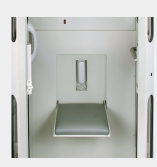
Fold Down Seat