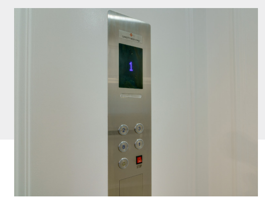
COP with Push Buttons (Optional)