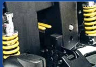
Easy-access freewheel levers