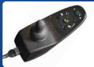
50A, dynamic shark controller

Power and precision combine into one exceptional power chair! The Jazzy ® 614 HD 1 features outstanding suspension and a tight turning radius. Large drive wheels and six-inch casters tackle uneven terrain, no matter where your day takes you.