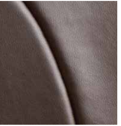
Vinyl - Dark

You can choose the fabric and color that you prefer.