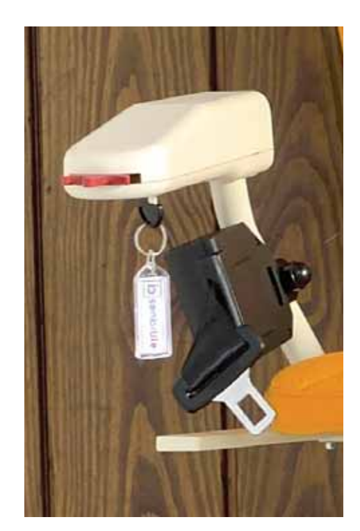
The safety key under the armrest disables the stairlift to avoid accidental start by chidren.