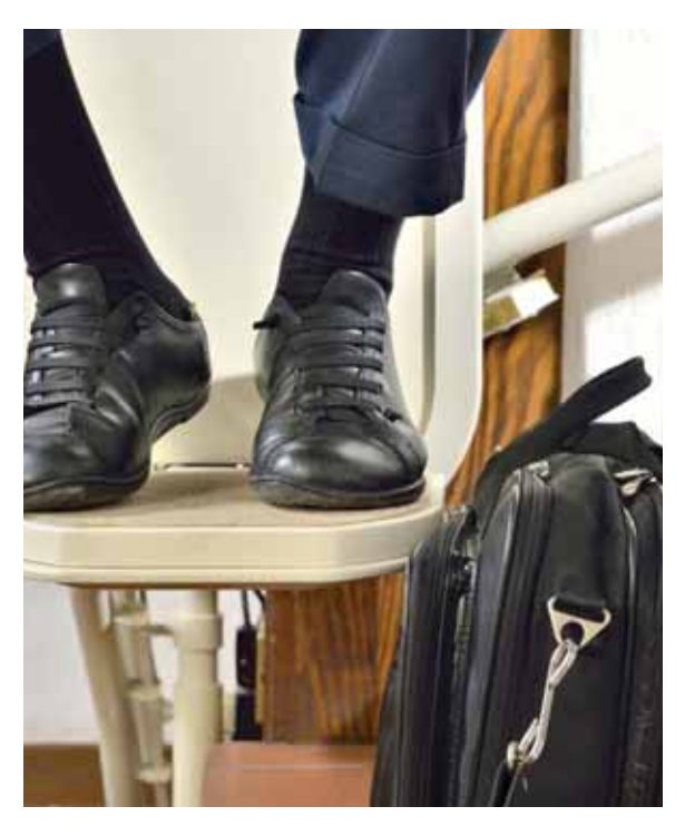
The security sensors set in the seat, the footrest and the carriage will stop the stairlift safely if an obstacle is detected.