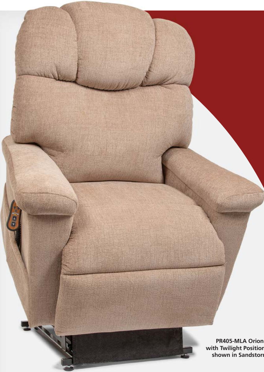
PR405-MLA Orion with Twilight Positioning shown in Sandstorm