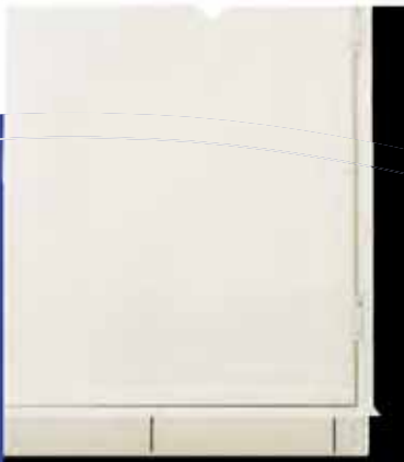
▲ Top landing gate with mechanical interlock that releases only when platform reaches the top of landing