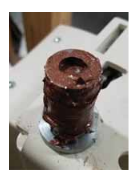
Swivel Handle Seat Post Bearings Latching Screw [Figure 7-5]