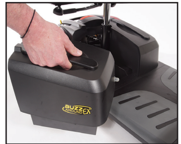
Step 2: Pull out the battery pack!