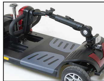
Step 3: Fold down tiller and lock in place!