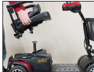
Step 1: Pop off the seat!

FDA Class II Medical Devices designed by Golden Technologies are intended to assist persons with chronic physical disabilities.