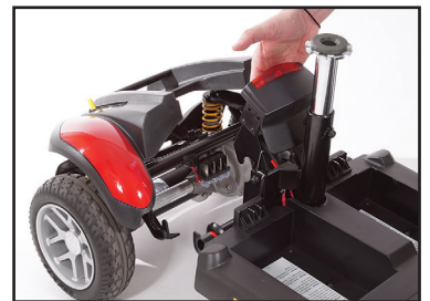
Step 4: Pull forward on the drivetrain release lever to separate the front and rear frame sections!