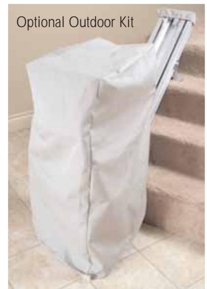
Optional Outdoor Kit

Use the optional side-car basket to carry groceries, laundry and other items up and down stairs.