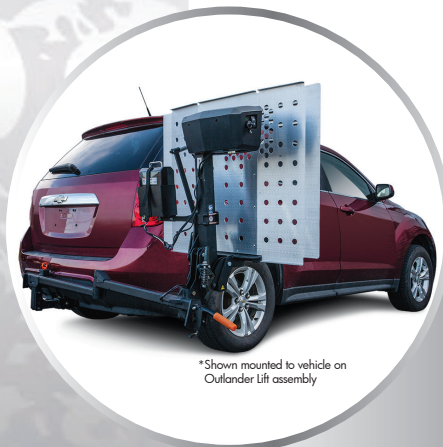
*Shown mounted to vehicle on Outlander Lift assembly