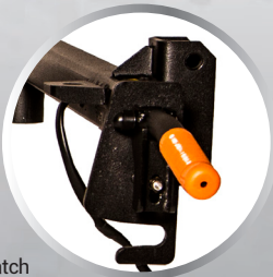
Auto-Latch Mechanism Handle